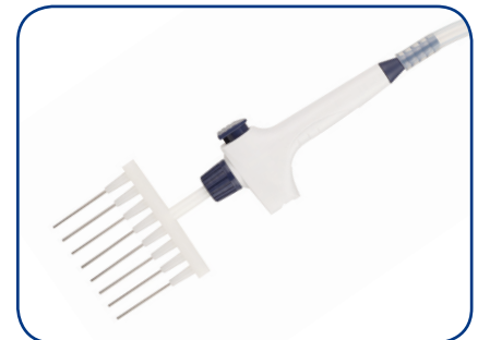
Hand set with 8-channel tip